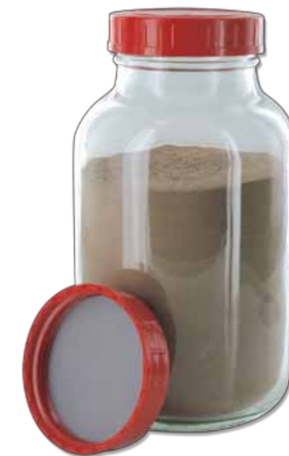
RK 1000 GT