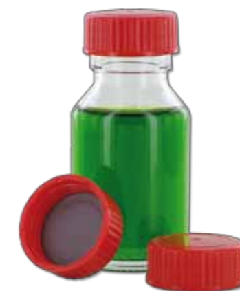
NK 50 GT