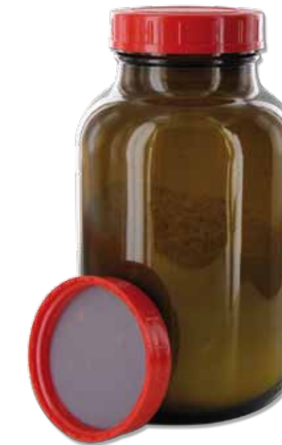
RB 1000 GT