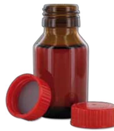
NB 50 GT